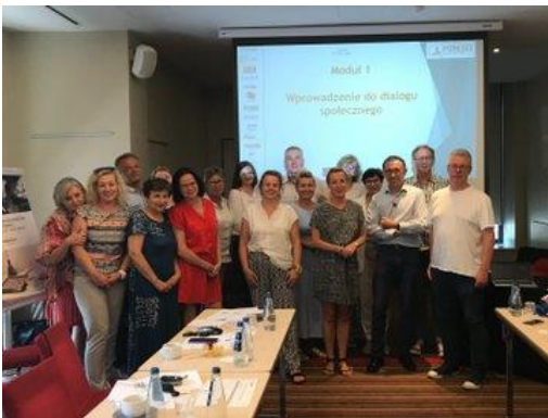
Federation of European Social Employers